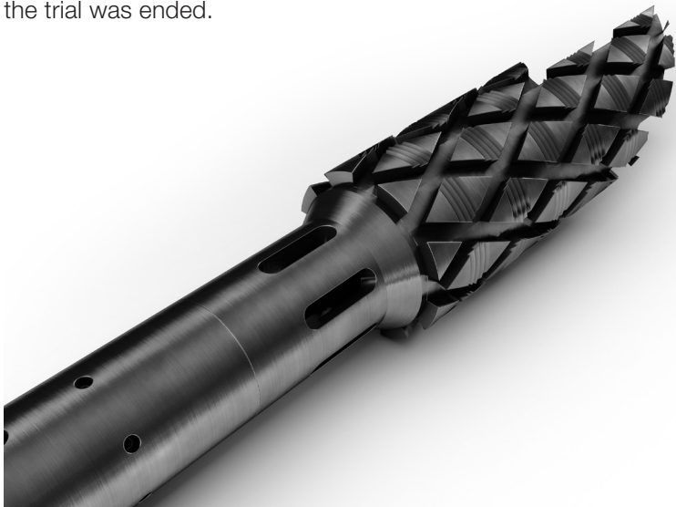
▲ Torque-Action Debris Breaker

Product Code(s): Torque-Action Debris Breaker – 117