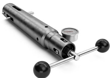
▲ Hydraulic Calibration Sub