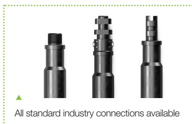
▲ All standard industry connections available

© 2021 Peak Well Systems Pty Ltd. All rights reserved. Revision: 10th August 2021